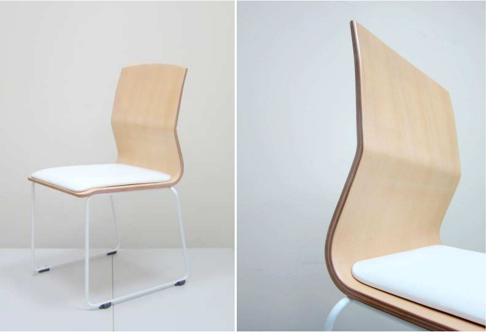
High tension tube frame

This high tension tube can be suffered the loading by 1.5 times more than normal steel.