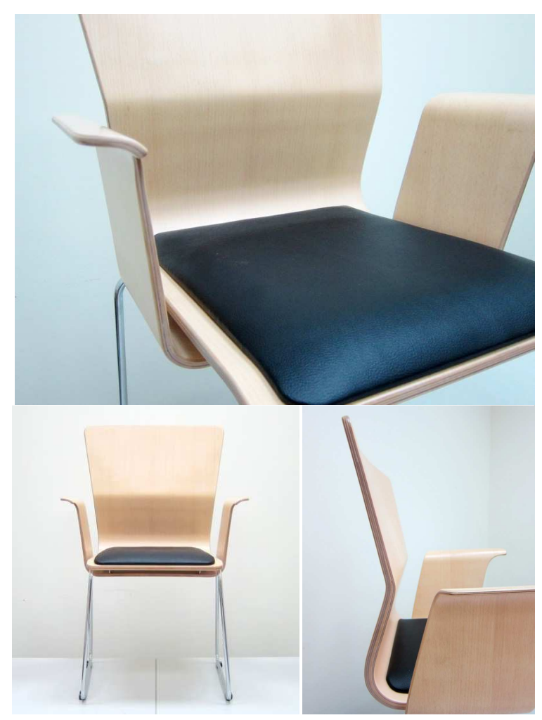
Ergonomic shell design