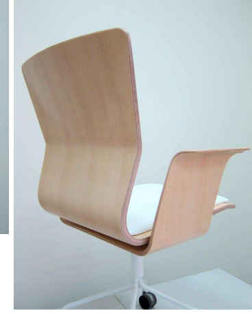
PVC leather or fabric cushion